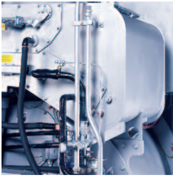
Aerodynamic recovery section for extremely smooth operation