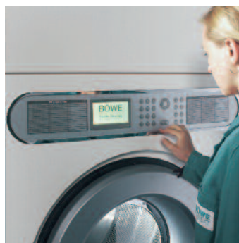
Easy-to-operate to the smallest detail

The control can easily be updated by reading from a standard MMC or SD card.