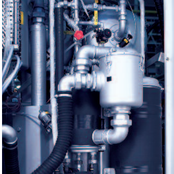
The SLIMSORBA adsorption unit

With the fully integrated SLIMSORBA adsorption unit you will achieve odour-free garments and an especially low residual solvent concentration.