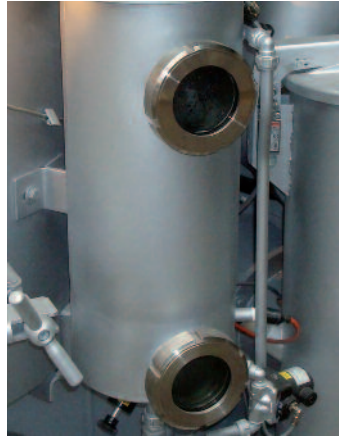
Free of maintenance: the self-cleaning water separator with integrated post water separator

still rake out system utilises a physical / chemical principle that guarantees that the residues are pumped off practically without any solvent.