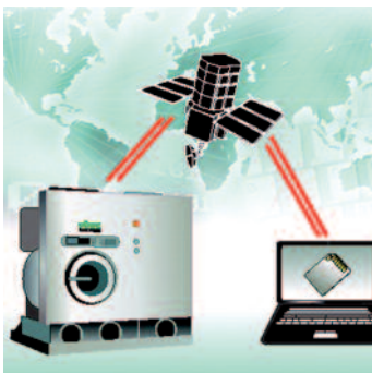
With BÖWE Direct Connect remote maintenance is possible