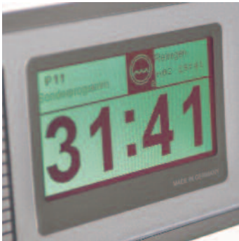
Easily viewed from a distance: the large-display remaining cycle time